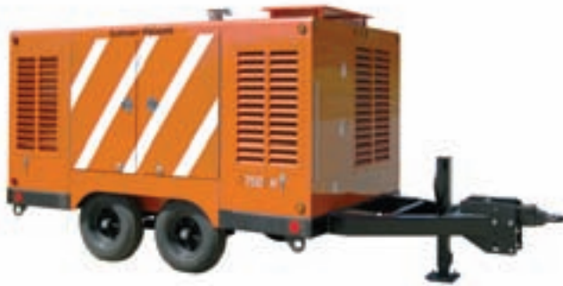
750 CFM TO 1800 CFM