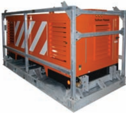
185 CFM TO 1800 CFM OFF SHORE COMPRESSOR