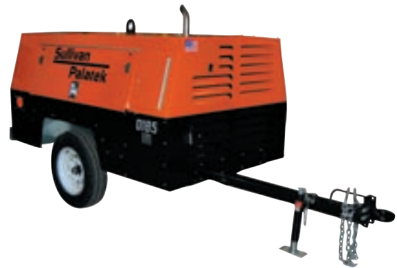
185 CFM - 210 CFM